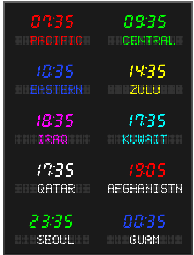
Model 6612AA - 1.8" time, 1.2" zone labels, 10 zones